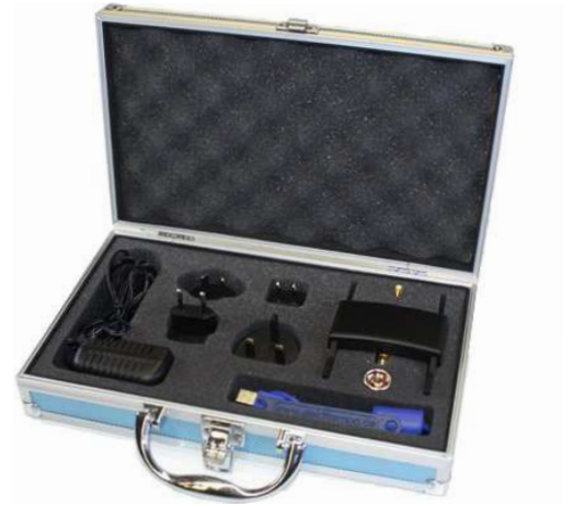
The transport case offers enough space for the preamp & accessories

The UBBV series enables maximum performance, particularly when measuring extremely weak signals e.g. in typical EMC test according to EN55022, EN55011 and so on.