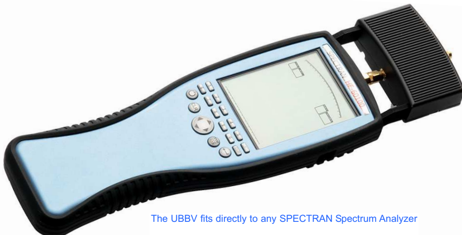
The UBBV fits directly to any SPECTRAN Spectrum Analyzer